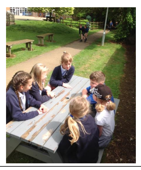
How Does Your Garden Grow?

Thank you to the Red Lion for donating their picnic benches. Children who have packed lunches have been enjoying using them at lunchtimes to eat lunch and making the most of this glorious weather. All children have enjoyed a sit down and a chat in the shade.